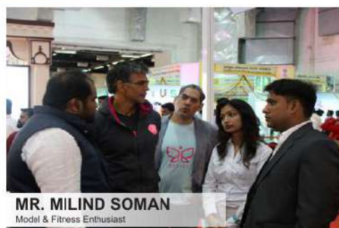
MR. MILIND SOMAN Model & Fitness Enthusiast