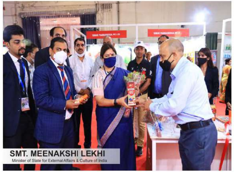
SMT. MEENAKSHI LEKHI Minister of State for External Affairs & Culture of India