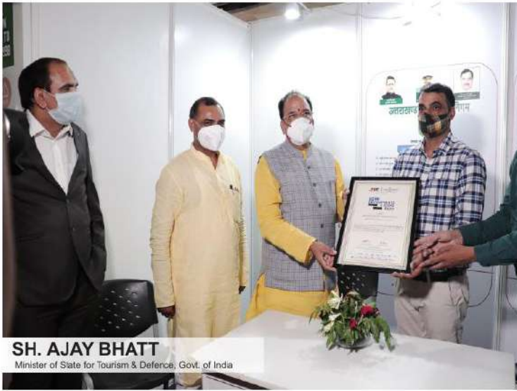
SH. AJAY BHATT Minister of State for Tourism & Defence, Govt. of India