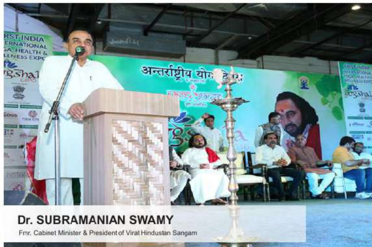
Dr. SUBRAMANIAN SWAMY Fmr. Cabinet Minister & President of Virat Hindustan Sangam