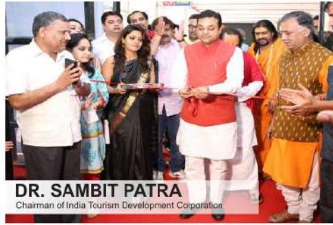
DR. SAMBIT PATRA Chairman of India Tourism Development Corporation