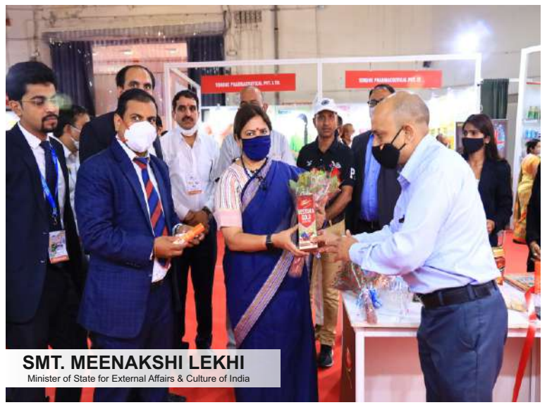
SMT. MEENAKSHI LEKHI Minister of State for External Affairs & Culture of India