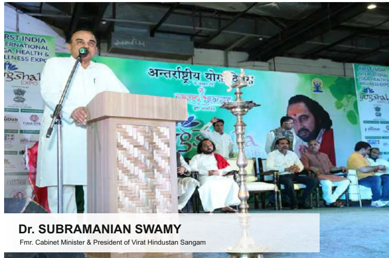
Dr. SUBRAMANIAN SWAMY Fmr. Cabinet Minister & President of Virat Hindustan Sangam