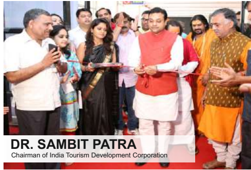
DR. SAMBIT PATRA Chairman of India Tourism Development Corporation