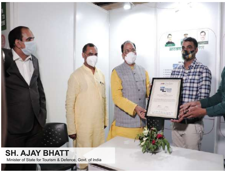
SH. AJAY BHATT Minister of State for Tourism & Defence, Govt. of India