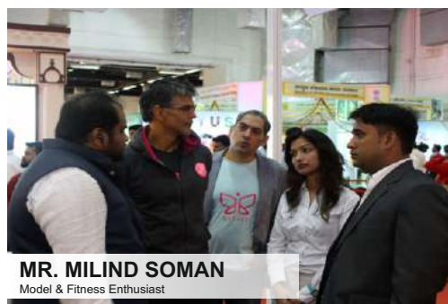
MR. MILIND SOMAN Model & Fitness Enthusiast